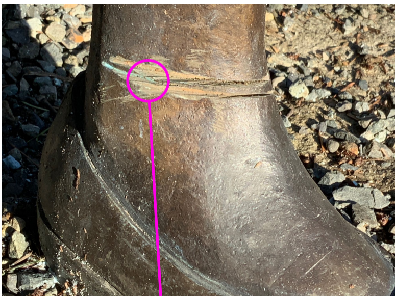
Attempted cut- looks like hacksaw marks. You can see green oxidation already forming.