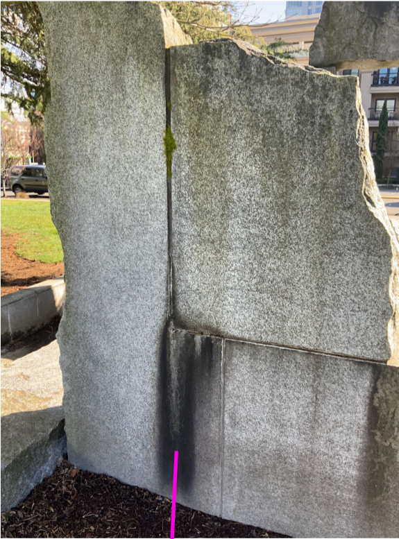
Lots of dirt and moss accumulating on the north sides.