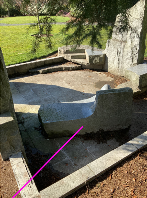
Lots of debris accumulating from overhanging tree limbs