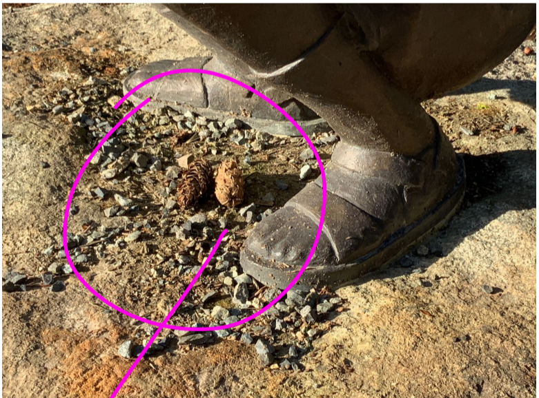
Lots of gravel/debris building up at base of all three sculptures.