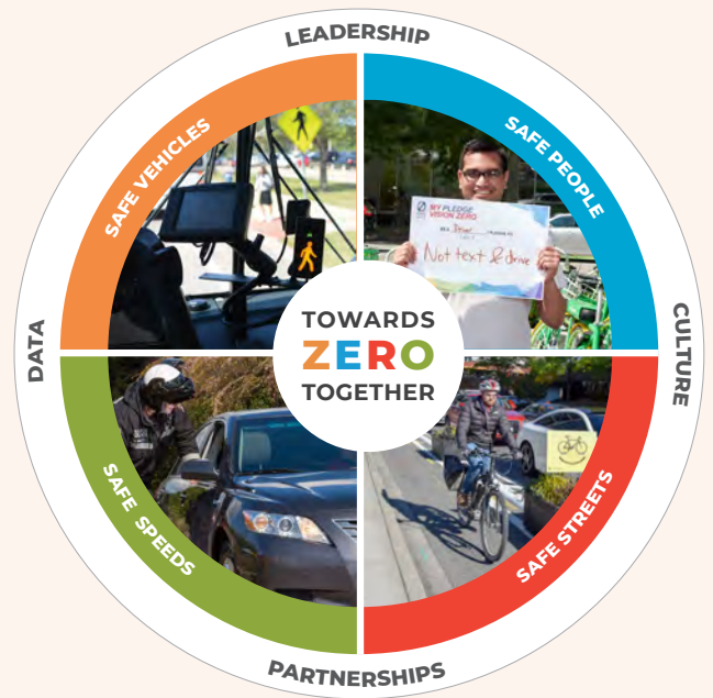
Figure 2: The Bellevue Safe Systems approach rests on four pillars (Safe Speeds, Safe People, Safe Vehicles, and Safe Streets) paired with four supportive elements (Data, Leadership, Partnerships, and Culture).

In its advisory role in the development of the city’s Strategic Plan, the Bellevue Transportation Commission examined the attributes of the Safe Systems approach and concurred that Safe People, Safe Streets, Safe Speeds, Safe Vehicles—as well as the supporting elements of leadership, culture, partnerships and data—all help contribute to reducing the frequency and severity of crashes (see Figure 2). This holistic approach accepts that people will make mistakes and that crashes will continue to occur, but it aims to ensure these do not result in serious injuries or fatalities.