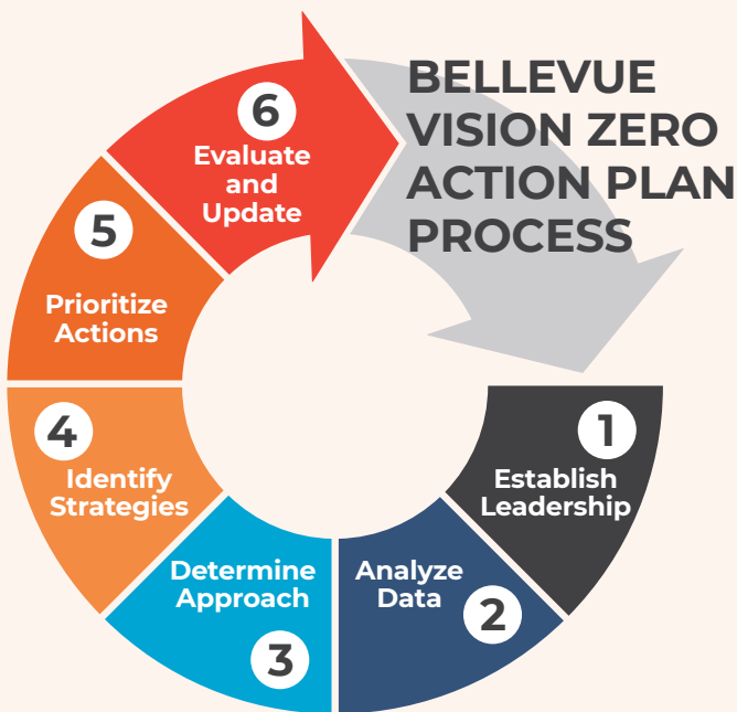
Figure 1: Process to develop Bellevue’s Vision Zero Strategic Plan and annual Action Plans.

The City of Bellevue is using a six-step process to develop, implement, monitor, and refine its Vision Zero strategy (see Figure 1).