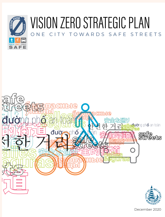
Figure 3: Bellevue's Vision Zero Strategic Plan acknowledges that new vehicle technologies, improved street infrastructure, lower vehicle speeds, enhanced public awareness, and more all contribute to reducing the frequency and severity of crashes.

The Strategic Plan articulates how the city will apply the Safe Systems approach to eliminate traffic fatalities and serious injuries by 2030 (see Figure 3). The plan coordinates existing efforts and new ideas, evaluates crash data, considers public concerns, and identifies strategies that will reduce traffic fatalities and serious injuries to zero by 2030. It articulates a coordinated approach across the city departments, ensuring that transportation engineers, first responders, and other key staff work together.